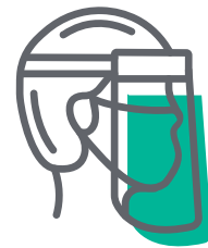
Face shield worn with other acceptable face mask

Note: we will have additional face masks available for any attendee that requires one