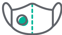
Face mask with vent