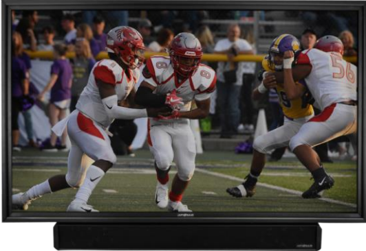
Apollo AE5550 55" Enclosure with OSB3800 Soundbar

A game-changer from down and back firing speakers, the Apollo Soundbar allows you to, once again, actually face the sound from your favorite programs.